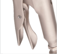
Fast unlock trigger