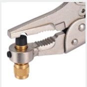
Hardened steel needle