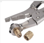
1/4" SAE interface