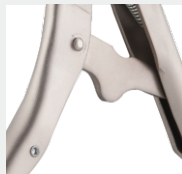
Hardened connecting rod