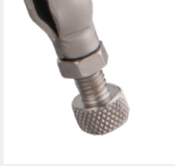
Hex key adjusting screw