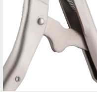
Harden stress rod